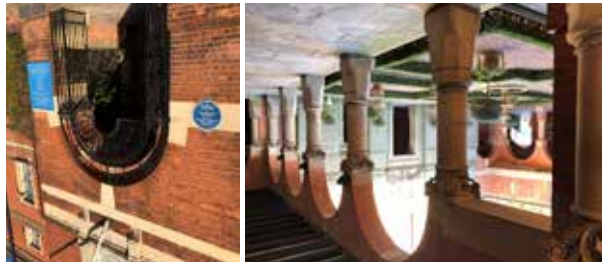
Here are some of the places you will see on the walk