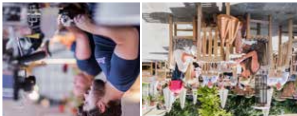
Edgbaston Village has a wide range of places to eat, drink and relax