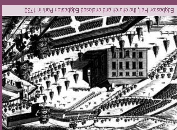
Edgbaston Hall, the church and enclosed Edgbaston Park in 1730

Birmingham Botanical and Horticultural Society obtained a lease on land off Westbourne Road and ten acres of the Botanical Gardens were first opened to the shareholders of the Society in 1832.