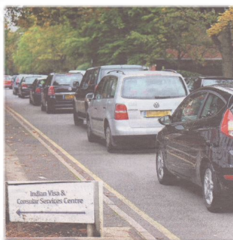
Article in The Birmingham Post 5 December 2013

A spokesperson for Birmingham City Council said: "We are aware of the issues and concerns raised by residents and businesses and have been collecting evidence from a range of sources in the past few weeks. This exercise will conclude within a couple of weeks and we will then assess the situation."